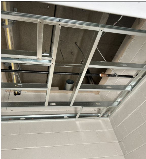
Hard ceiling framing in the bathrooms is complete.