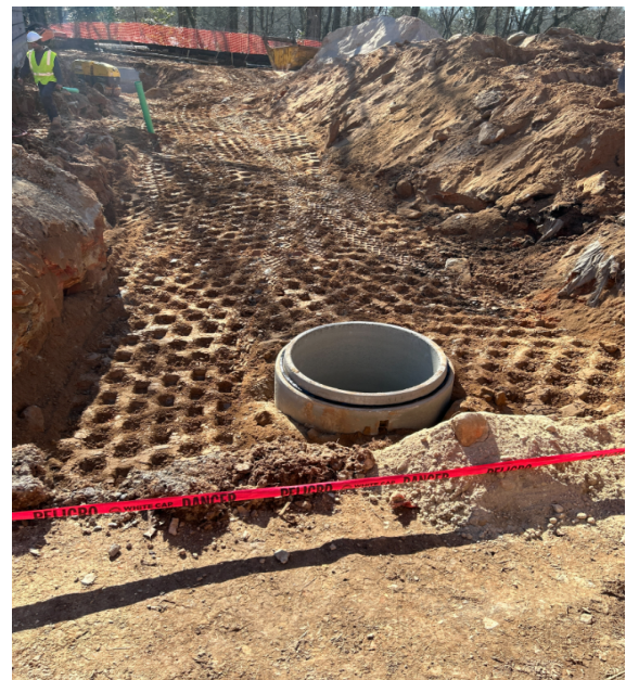
Sanitary sewer line has been set in place