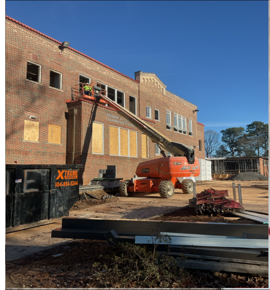
Continue exterior glass removable.