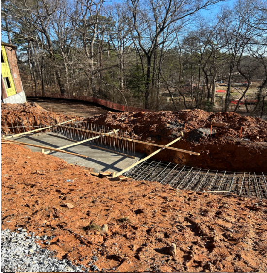
Began forming up retaining walls at the courtyard area.